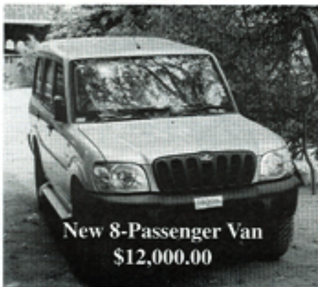
New 8-Passenger Van $12,000.00