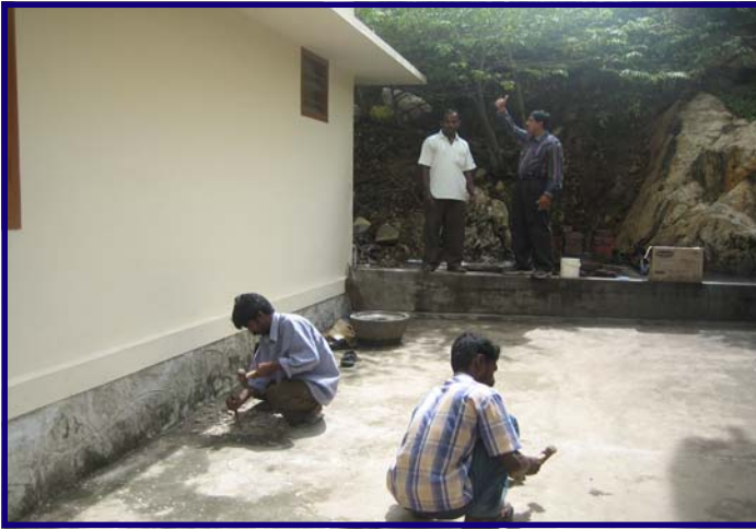
(Above) The contractor, foreman and two workers have begun the construction of our new two-story kitchen and remodeling of our current first-floor dining room. This remodeling will increase our dining room seating capacity from 60 to 100. This construction will connect Kristin Cottage to our dining room & apartments.