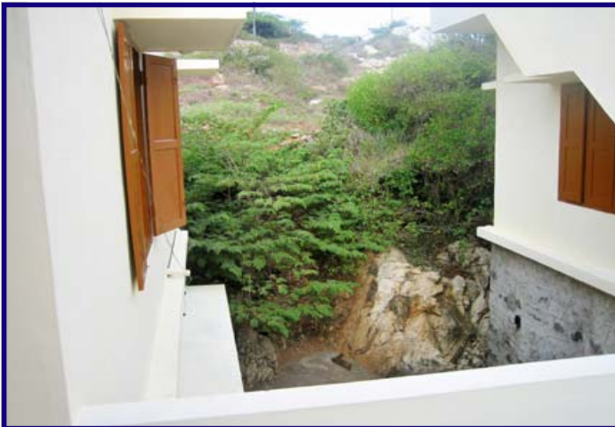
(Above) This is the two-story "space" that will have a first floor kitchen for the main dining room and provide a second floor faculty dining room and kitchen. It will serve as a faculty coffee room and a place to access the Internet for e-mail. (Below) Our students make their way to the chapel for graduation and communion.